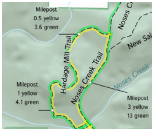
Work area for October Work Day.