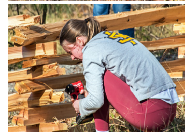
Newsletter 15 http://kennesawmountaintrailclub.org