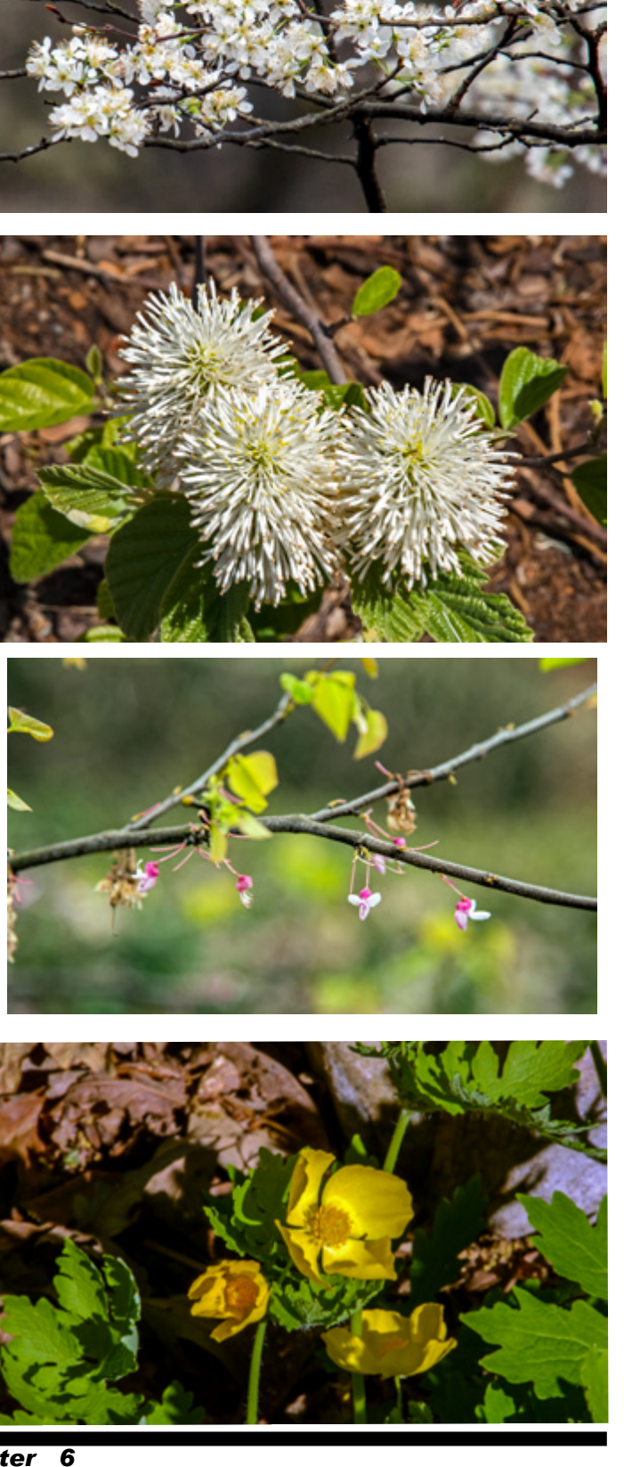
Newsletter 6 http://kennesawmountaintrailclub.org